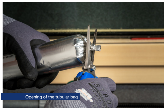
Opening of the tubular bag