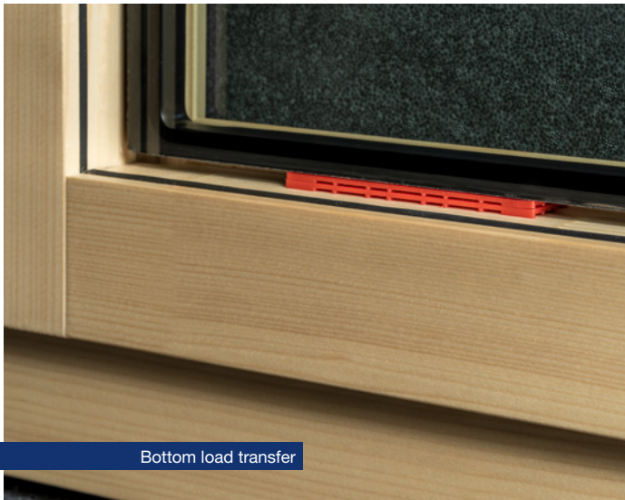
Bottom load transfer