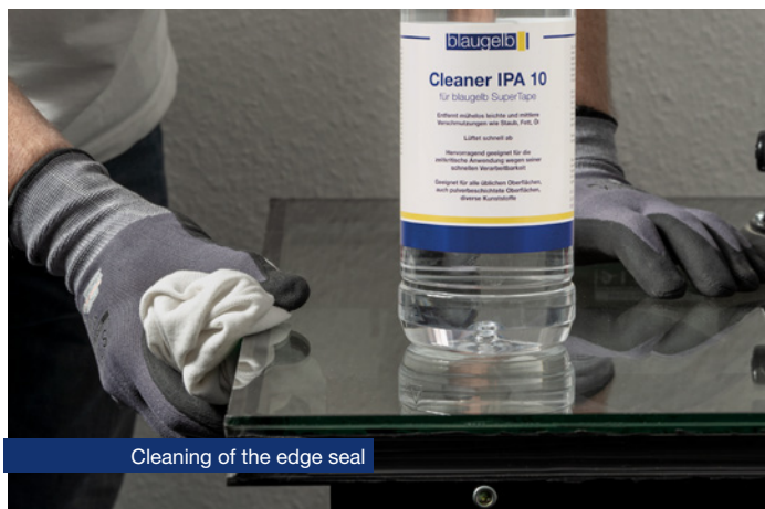
Cleaning of the edge seal