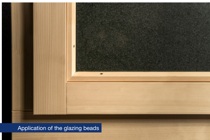
Application of the glazing beads

Note: The window should be placed in a resting support directly after completion. This results in a homogeneous full cure of the adhesive without hair-line cracks. The time to be spent in the resting support is a direct factor of: pane thickness, rebate area clearance, ambient temperature and ambient humidity.