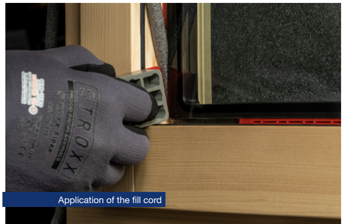
Application of the fill cord