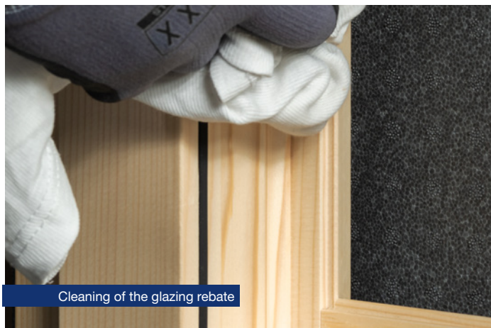
Cleaning of the glazing rebate