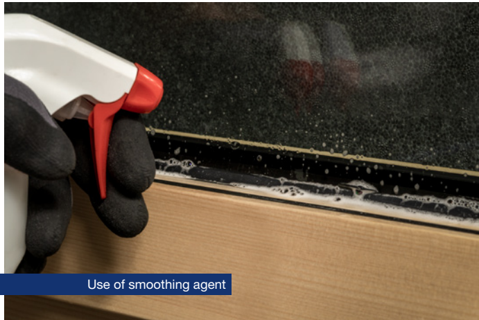
Use of smoothing agent