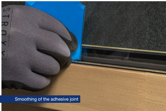
Smoothing of the adhesive joint

Adhesive residues on visible surfaces can be easily removed with blaugelb Cleaning Wipes (item no. 241602) when fresh.