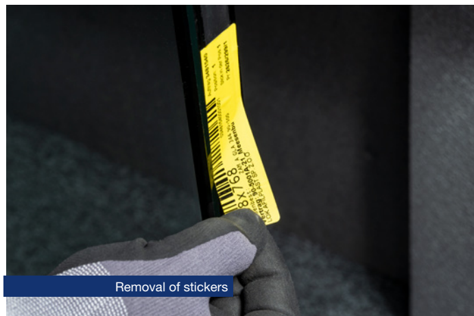
Removal of stickers