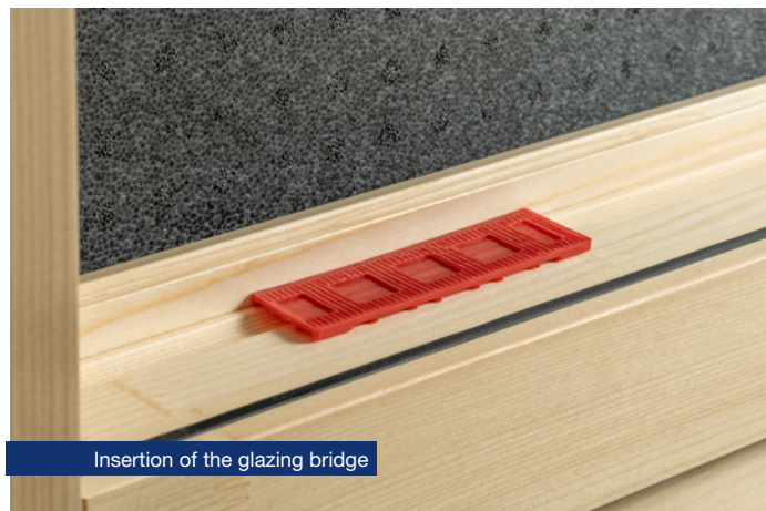
Insertion of the glazing bridge