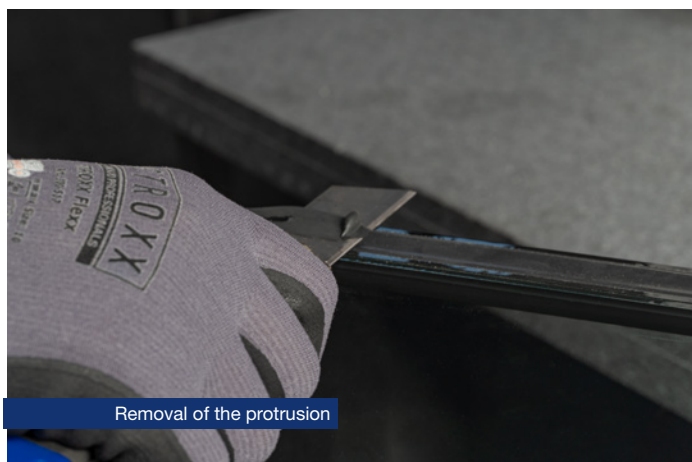
Removal of the protrusion