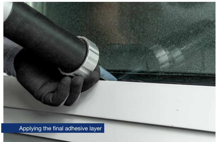
Applying the final adhesive layer

Curing speed without moistening = 3 mm/24 h. Cavity-free (bubble-free) filling of the rebate area must be ensured to eliminate any risk of moisture accumulation.