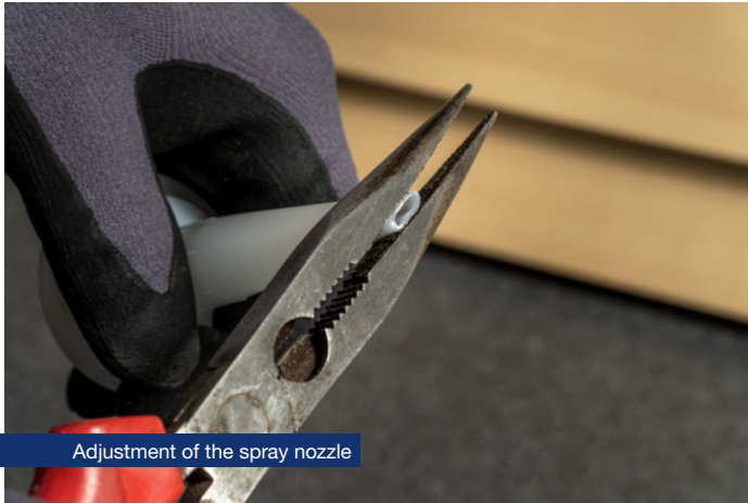
Adjustment of the spray nozzle