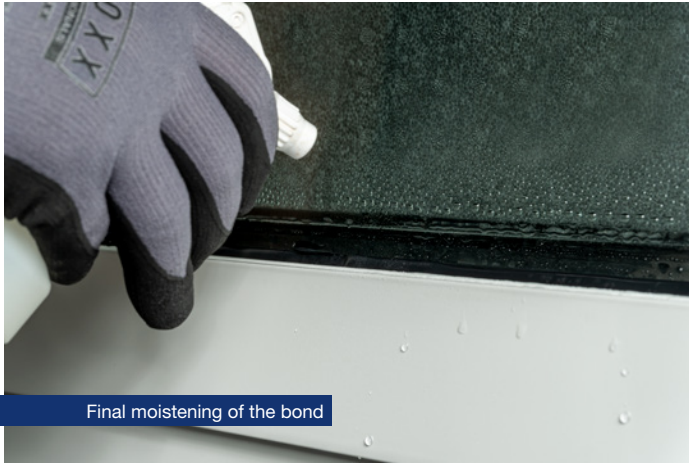
Final moistening of the bond

There is no need to smooth the blaugelb RC Adhesive, but any protruding, disrupting adhesive (glazing bead) must be removed immediately. Adhesive residues on visible surfaces can be easily removed with blaugelb Cleaning Wipes (item no. 241602) when fresh.