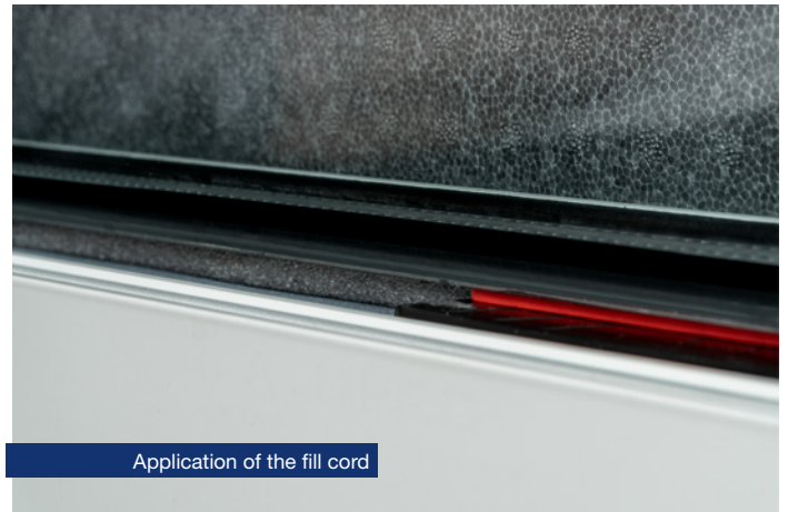
Application of the fill cord