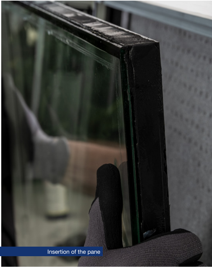
Insertion of the pane

05 Insertion of the pane according to glazing guidelines, including blocks as per the system specifications. The safety glass (at least P4A) can be installed on both the room side and the weather side. Deviations resulting from independent tests must be observed.