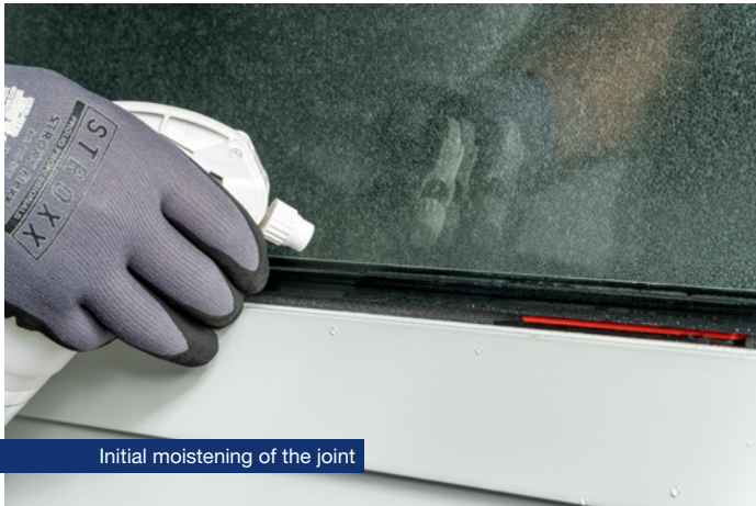
Initial moistening of the joint