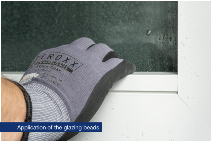
Application of the glazing beads

Note: The window should be placed in a resting support directly after completion. This results in a homogeneous full cure of the adhesive without hair-line cracks. The time to be spent in the resting support is a direct factor of: pane thickness, rebate area clearance, ambient temperature and ambient humidity.