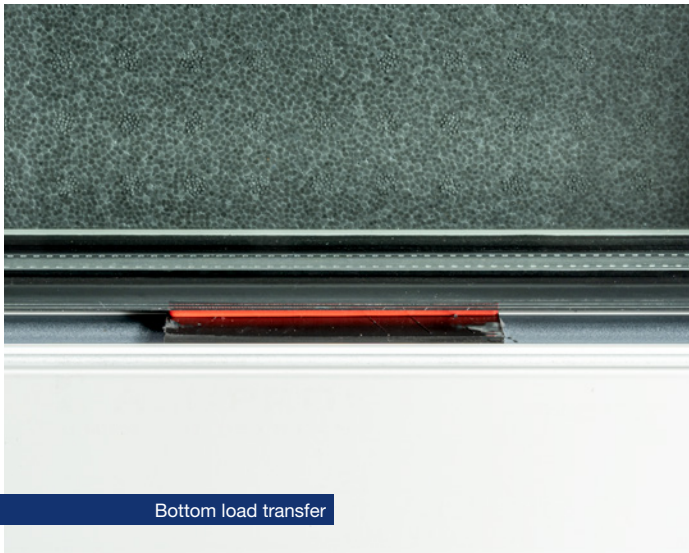
Bottom load transfer

06 If the safety glass is positioned on the room side, a backfill cord is required to limit the amount of blaugelb RC Adhesive applied. A tool is required to position the backfill cord as the safety glass must be bonded along the entire pane thickness.