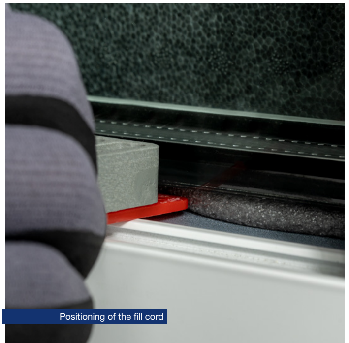
Positioning of the fill cord