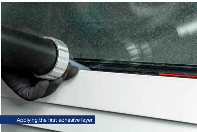
Applying the first adhesive layer