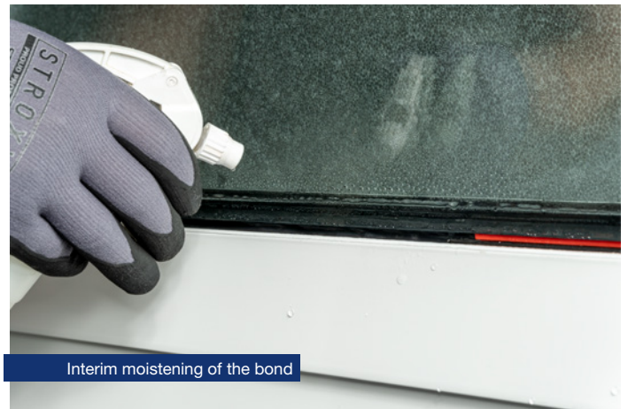
Interim moistening of the bond